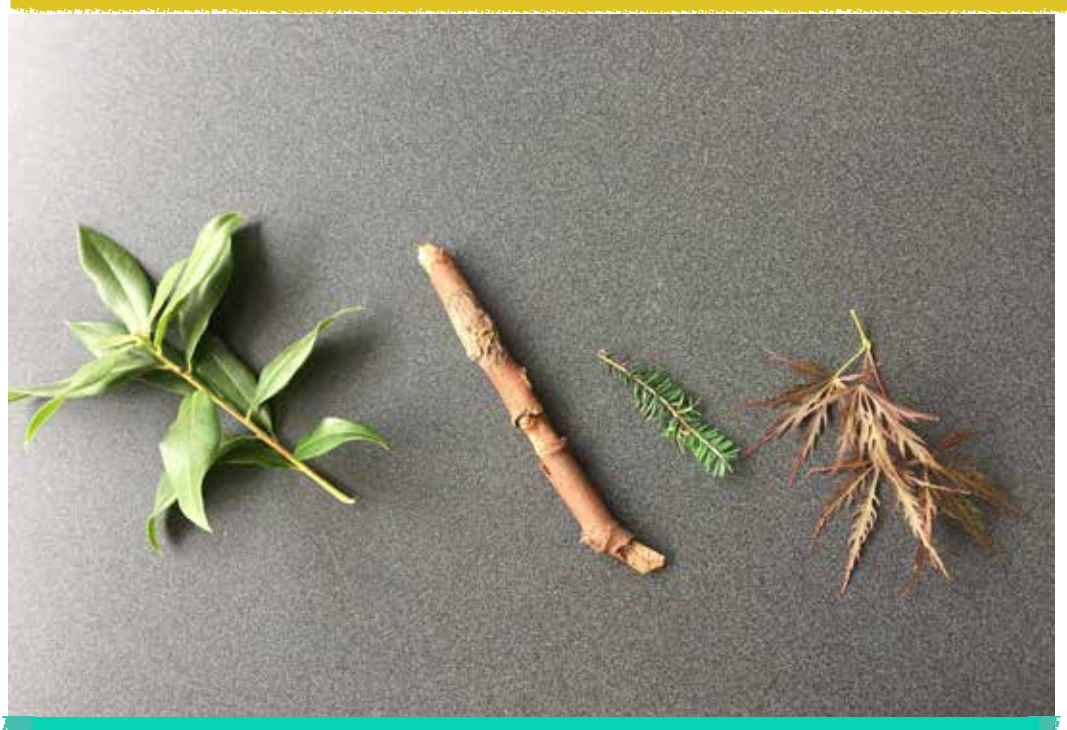
A variety of object textures help students utilize different drawing motions.