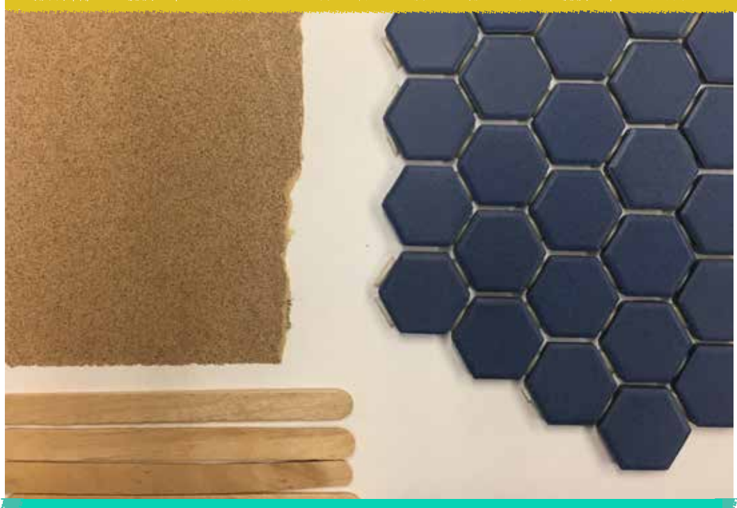
Glue materials for rubbings on cardboard sheets to make several at a time.