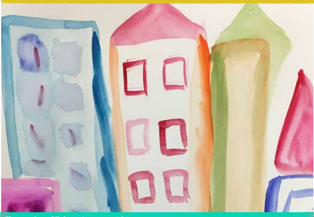
Have students fill the entire paper with images.