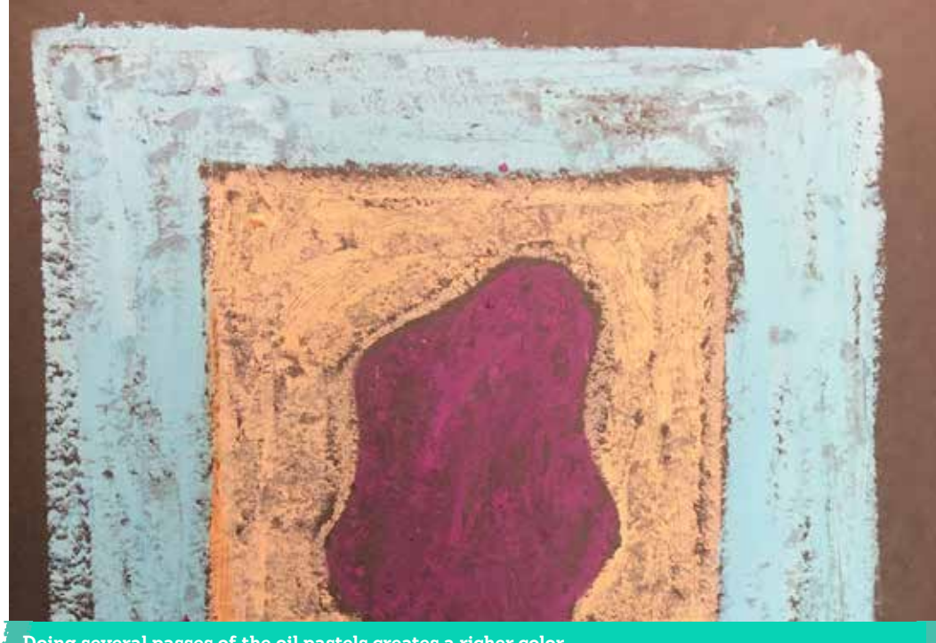
Doing several passes of the oil pastels creates a richer color.