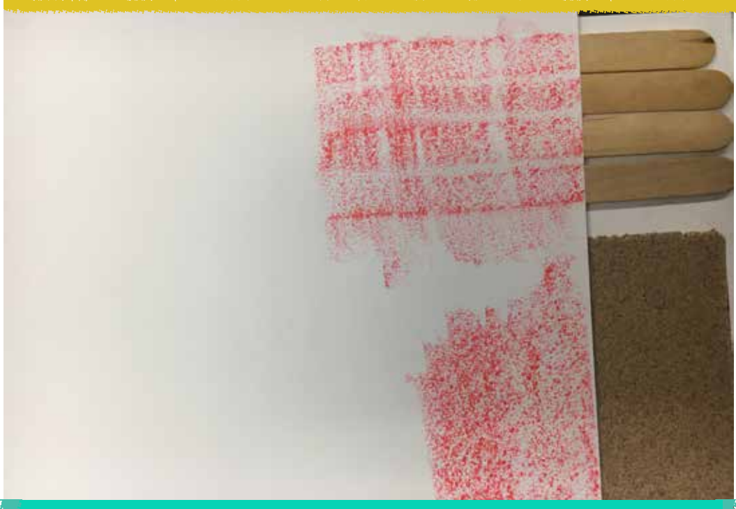
Move the rubbing crayon in the same direction each pass for best results.